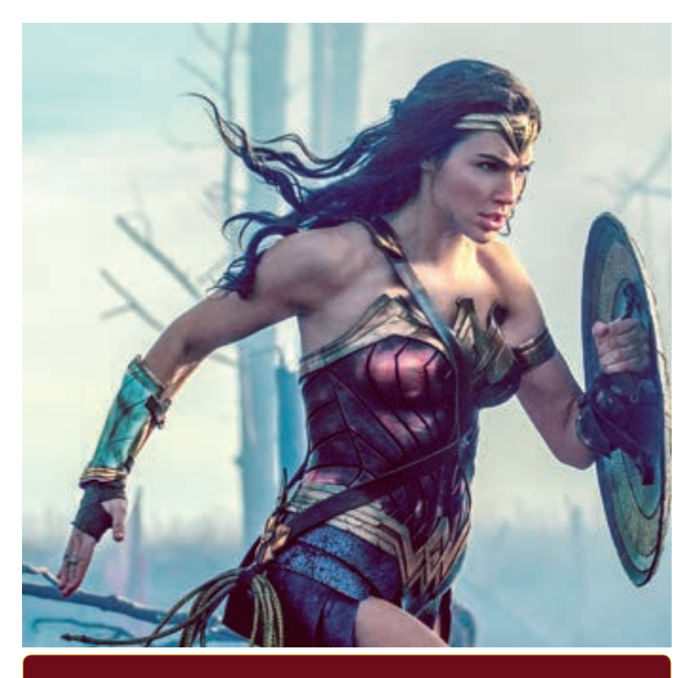
Gadot performs as Wonder Woman in a scene from the 2017 movie.

Wonder Woman tells the story of Diana Prince, an immortal Amazonian princess. When a World War I (1914–1918) pilot crashes near her home island, Diana rescues him. Then the pair leave the island to end the war and save the world from destruction. "I think it's so important that we have . . . strong female figures to look up to, and Wonder Woman is an amazing one," Gadot said. "It's great that . . . finally she gets her own movie."